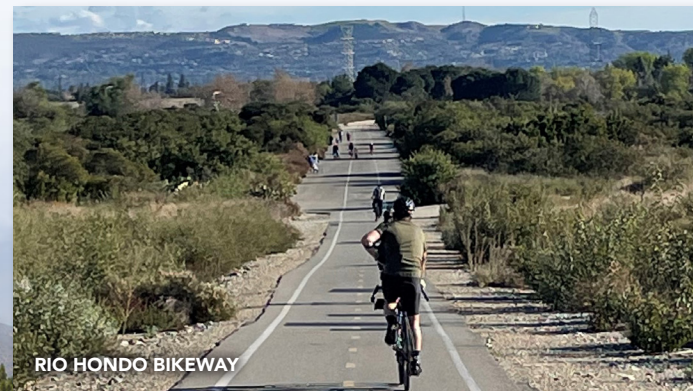
RIO HONDO BIKEWAY

* Conceptual section, right-of-way configuration depends on available space. **The Greenway may include equestrian usage where appropriate.