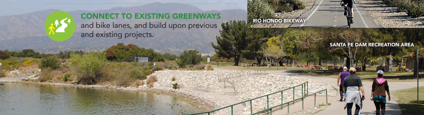
SANTA FE DAM RECREATION AREA